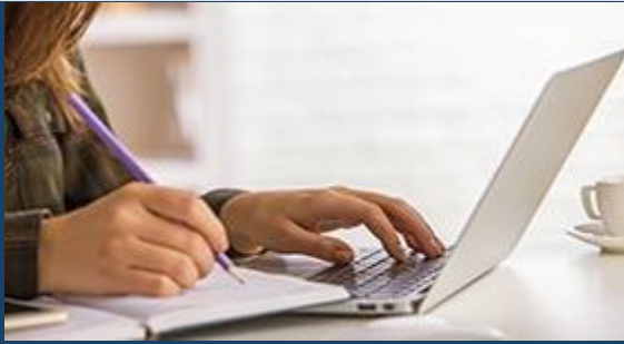
Global trends and challenges in legal education and legal practice Webinar, 28 Jan 2021, 1300 GMT