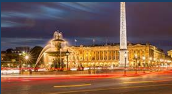
Current legal developments in European private M&A Webinar, 4 Feb 2021, 1300 GMT