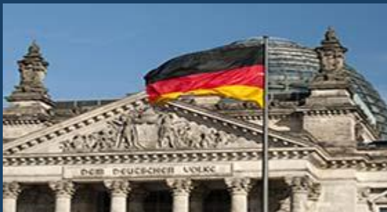
A game changer in the making: the pending German Corporate Sanctions Law Webinar, Feb 2021