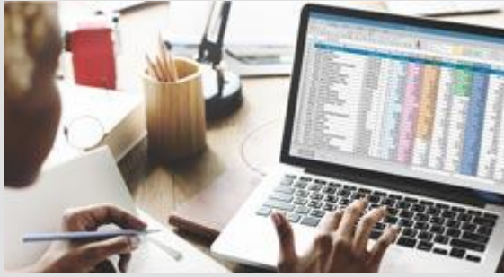
10th IBA London Finance and Capital Markets Virtual Tax Conference Virtual Conference, 18 Jan - 24 Feb 2021